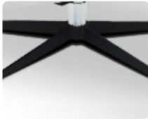
FOOT OPTION 2: STAINLESS STEEL TITANIUM FINISHING SWIVEL BASE

LEATHER COLOR SHADE DIFFERENCES: The model upholstered with some Natural leather such as Maya, Moss, Oxford and Cashmere, could present in some area differences in color tones of about 5%. Such differences are not to be considered defect but an expression of the natural characteristic of the cowhide. The company reserves the right without prior notice to make technical sheets changes and/or materials for quality product improvement. Leather sofas are a handmade product and according to the leather covering selected there could be a measurement tolerance of about 2 inches (cm 5) on each sku.