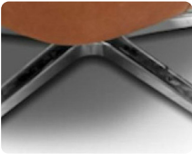
FOOT OPTION 1: STAINLESS STEEL SWIVEL BASE